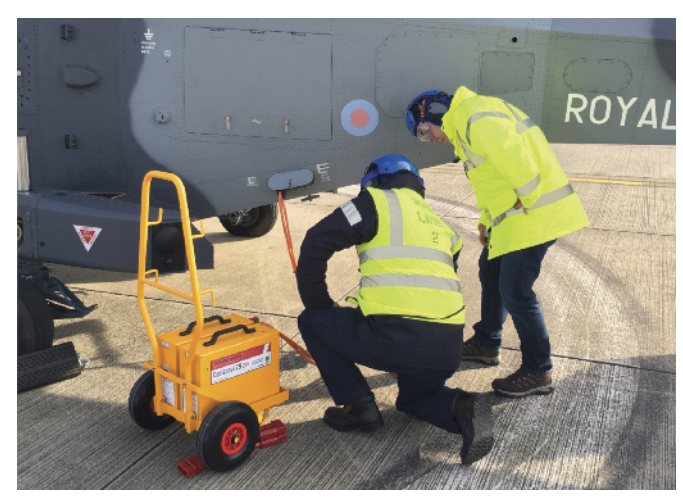
Coolspool 29 Twin: starting Lynx Wildcat