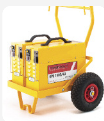
GPU 1500/40 Twin