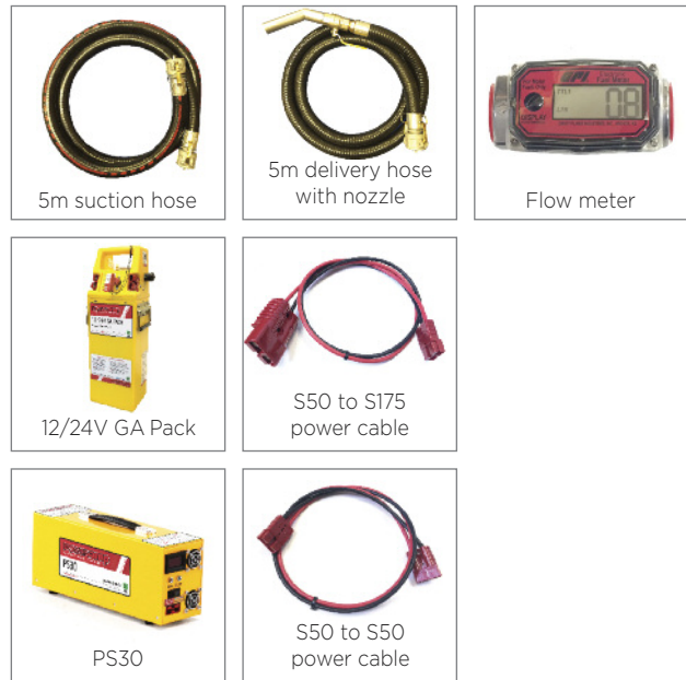
5m suction hose