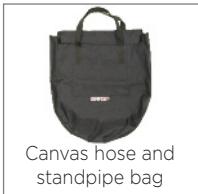
Canvas hose and standpipe bag