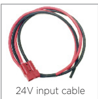
24V input cable