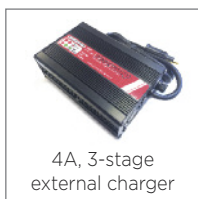
4A, 3-stage external charger