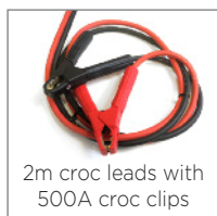
2m croc leads with 500A croc clips