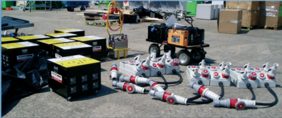
Cabling, switch gear, cable trunking, junction boxes, power supplies and GPUs