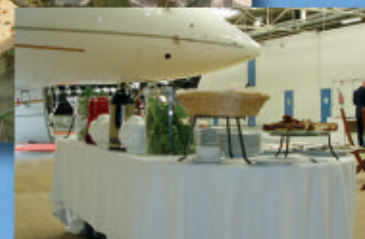
VIP aircraft handover ceremony: local rental of all materials, on-site coordination by Powervamp local agent