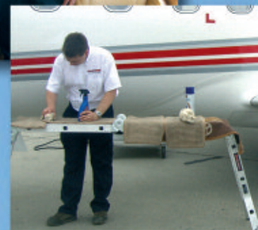
Special carpet deep clean