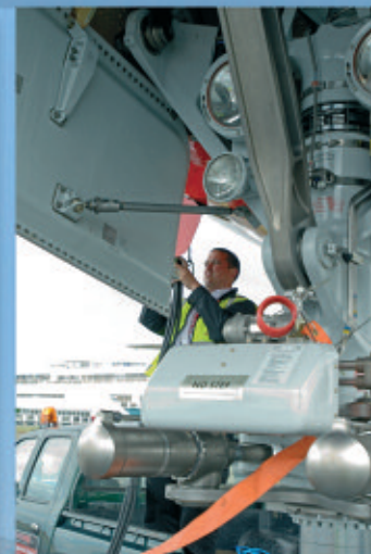
Boeing 777 power hook-up