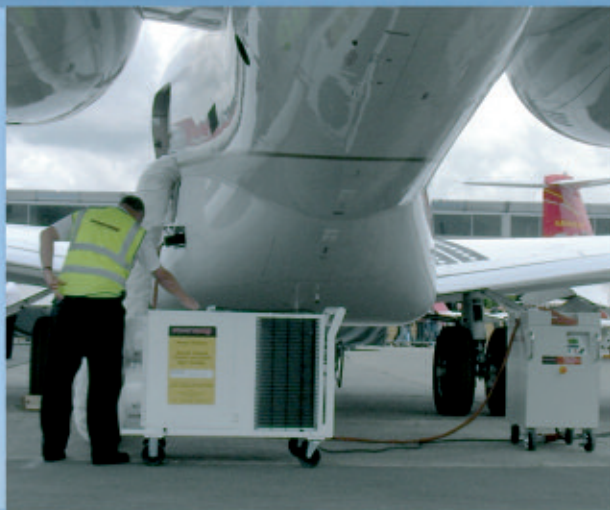
Spot cooler and 115v 400Hz solid state converter

Back-up equipment is always shipped to the venue and is held on site for immediate 'swap-out' in case a failure occurs. However, because Powervamp designs, manufactures, owns and operates most of its equipment, its on-site team is usually able to quickly diagnose and fix the problem in less time than it takes to deliver and connect a replacement unit.