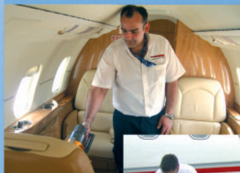
Typical twice-daily cabin refresher