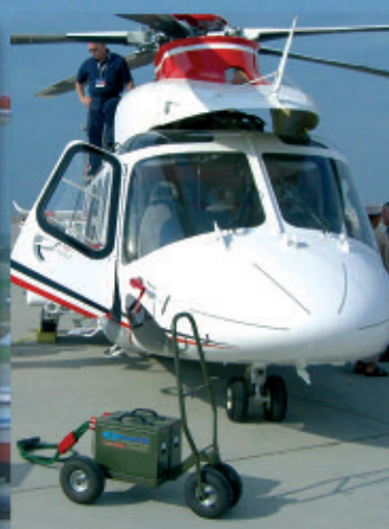
The CoolSpool 58