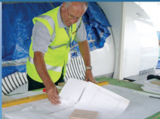
Static area project management

Powervamp's comprehensive airshow support services range from the supply of 28v DC and 115v 400Hz ground power and air coolers to full project management of the static area, including aircraft positioning, cleaning and many other specialist services