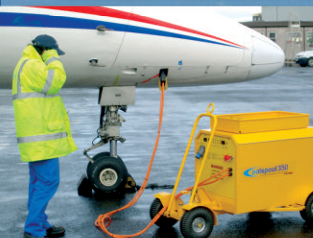
The CoolSpool 350

Powervamp equipment is in daily revenue service worldwide