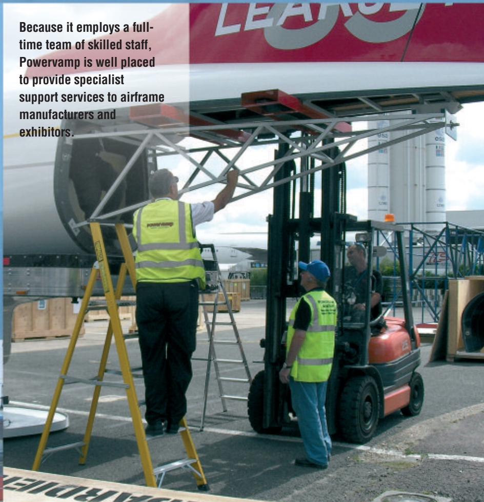
Skilled engineering staff

Typical of these services is the delicate build up and disassembly of the airframe, including all internal electrical connections. Usually Powervamp will appoint a dedicated team leader to liaise with the manufacturer at an early stage and thereby ensure continuity and peace of mind as the mockup is shipped to various international events.