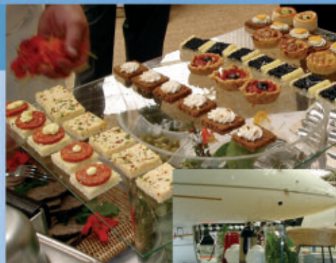
VIP food: prepared and served to a client's set budget