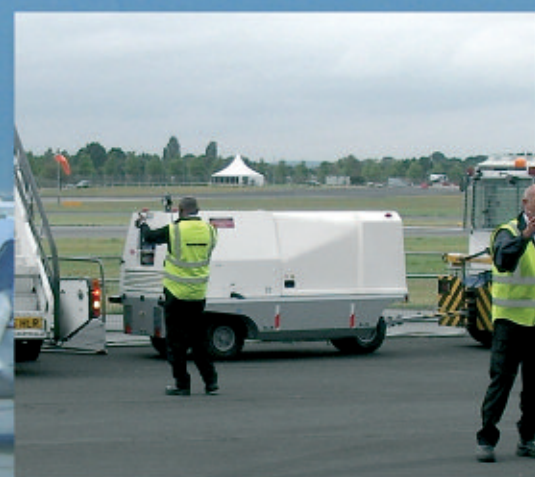
Remotely parked VIP aircraft necessitate the use of diesel GPUs