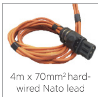
4m x 70mm 2 hard-wired Nato lead