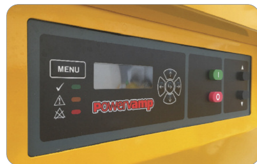
Large, backlit control panel