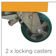
2 x locking casters