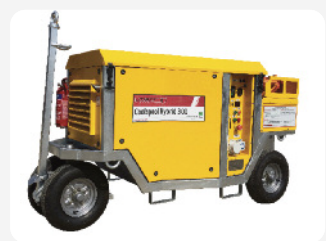
Coolspool Hybrid 300