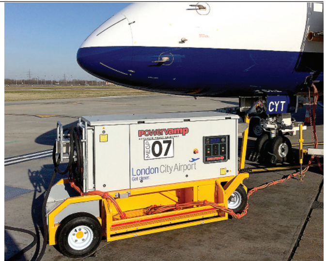
PV90-3: in operation at London City Airport