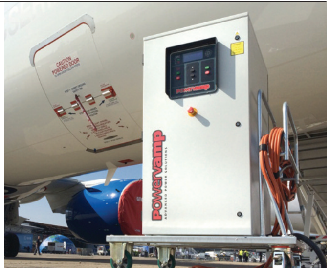
PV90-3: specified to provide ground power at the Paris International Airshow 2015