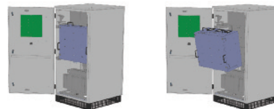
Power module plugged in

One of the most outstanding features of the PV90-3 is the pluggable Power Module. In unlikely event of system failure, the "HEART" of the system can be easily replaced by first line maintenance staff in a matter of minutes.