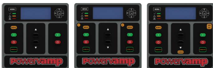
Single 400Hz output