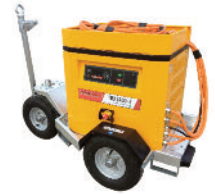
Towable trailer (option)