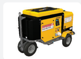
Coolspool Hybrid 300