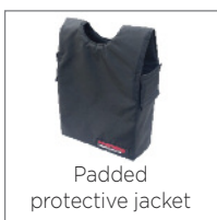
Padded protective jacket