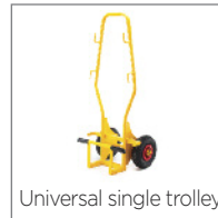
Universal single trolley