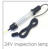
24V inspection lamp