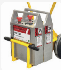
GPU 1700 Twin