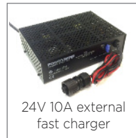
24V 10A external fast charger