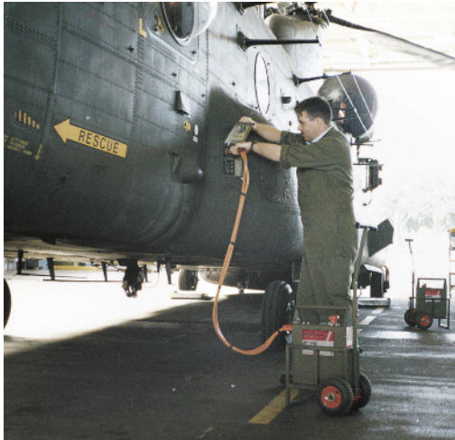
GPU 1700: Chinook line maintenance

** Peak amps is a theoretical calculation of the instantaneous current from a momentary dead short across the battery terminals. It is not representative of the power delivered at the aircraft plug due to cable losses and other factors. This figure is only shown for comparative purposes.