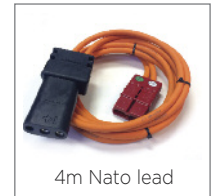
4m Nato lead