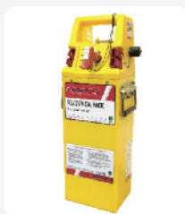
12/24V GA Pack