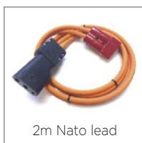
2m Nato lead