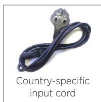
Country-specific input cord