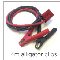
4m alligator clips