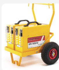
GPU 1500/40 Twin