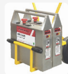
GPU 2400 Twin