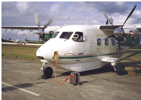
GPU 1700 Twin: PT6-67A start PZL Skytruck

** Peak amps is a theoretical calculation of the instantaneous current from a momentary dead short across the battery terminals. It is not representative of the power delivered at the aircraft plug due to cable losses and other factors. This figure is only shown for comparative purposes.