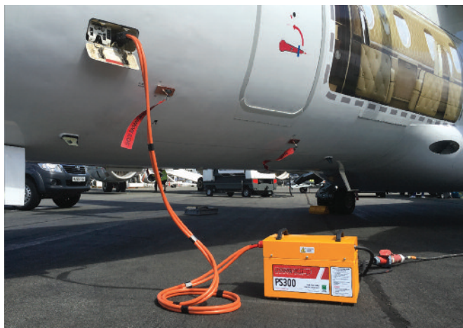
PS300: in operation on a Dornier 328