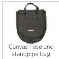
Canvas hose and standpipe bag