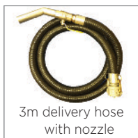
3m delivery hose with nozzle