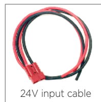
24V input cable