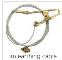
3m earthing cable