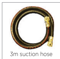
3m suction hose