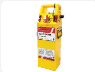
12/24V GA PACK