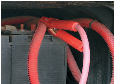
Volts x amps = watts, and watts are critical in delivering cranking performance. No other clip can handle the current like a Powervamp clip.