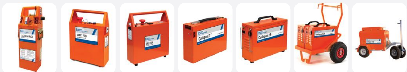
12/24V GA Pack

† If using Jet A1, JP8 or similar, some loss of power will occur compared to diesel due to jet fuel's lower calorific value.