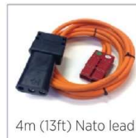
4m (13ft) Nato lead