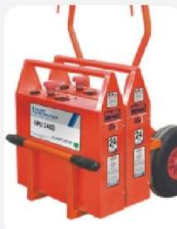
GPU 2400 Twin