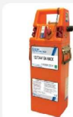
12/24V GA Pack