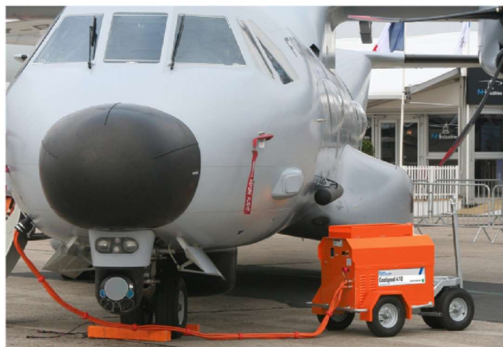
Coolspool 410: in operation on CASA 235