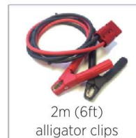
2m (6ft) alligator clips