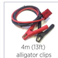
4m (13ft) alligator clips