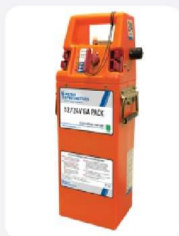
12/24 GA Pack