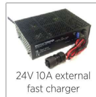
24V 10A external fast charger