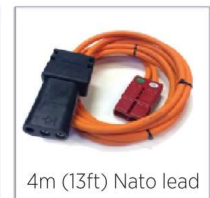
4m (13ft) Nato lead