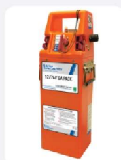
12/24 GA Pack