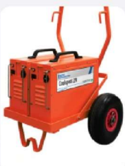
Coolspool 29 Twin