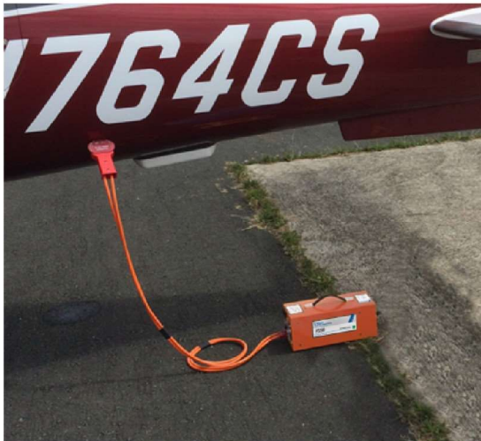
PS50M: in operation on a Cessna TTx