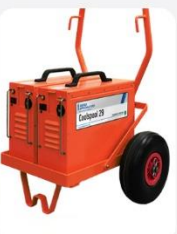
Coolspool 29 Twin