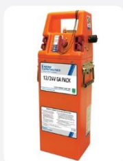
12/24V GA Pack