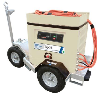
Towable trailer (option)