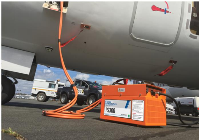
PS300: in operation on a Dornier 328