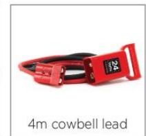
4m cowbell lead