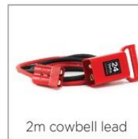
2m cowbell lead