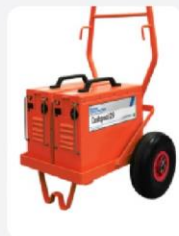
Coolspool 29 Twin